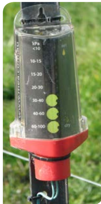
Close up of a manual read G-dot device.